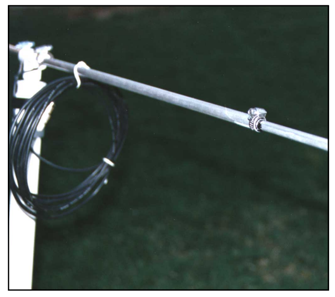
Figure 4—Complete the Simple Sixer by sliding in the narrower aluminum tubes and tightening the hose clamps.