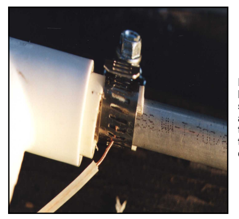
Figure 2—Use hose clamps to secure the aluminum tubing to the PVC T and to attach the coax conductors.